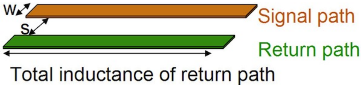
Figure 1 Geometry considered in this rule of thumb

In this rule of thumb, we will consider the very special geometry of two flat conductors, like adjacent leads in a lead frame package. An example of the geometry we analyze is shown in Figure 1.