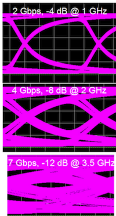
Figure 2 Eye diagrams for three different PRBS data rates and the attenuation at the Nyquist

We can explore, as the data rate increases, and the unit interval decreases, what the connection is between the collapse of the eye and the attenuation at the Nyquist. The following figure shows three examples of different data rate PRBS patterns through this channel and the resulting collapse compared with the attenuation at the Nyquist.